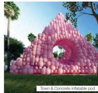
Town &amp; Concrete inflatable pod

OfficePOD was designed to eliminate distractions so expect decent soundproofing and sleek interior design. The pod can be hooked up to a battery system or the electrical grid itself for lighting and climate control.