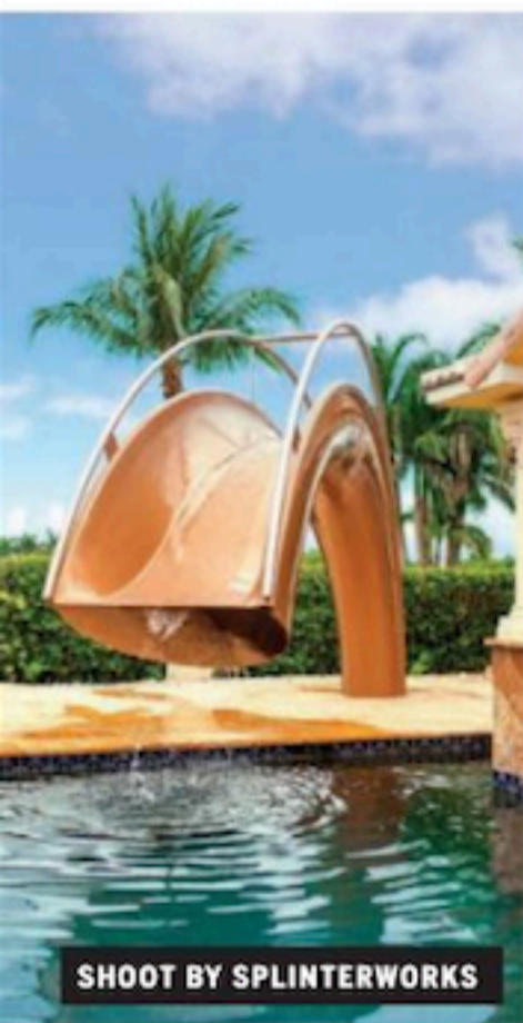
SHOOT BY SPLINTERWORKS