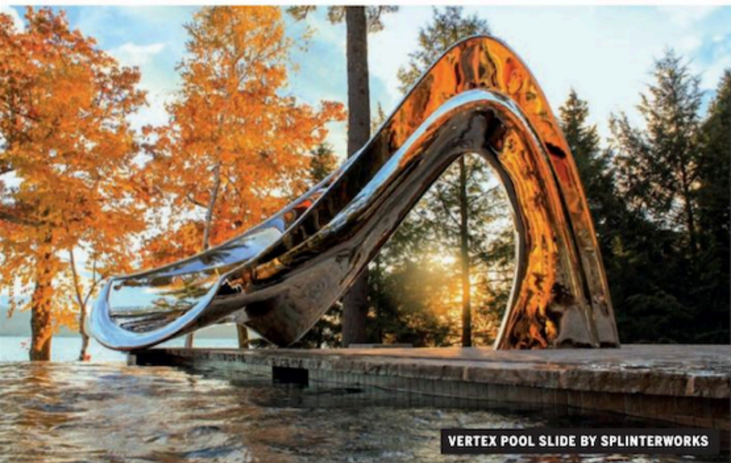
VERTEX POOL SLIDE BY SPLINTERWORKS

SplinterWorks is currently the only company making sculptural pool slides. To date, most of the work has been with residential clients, but the company now has pieces being installed into hotels.