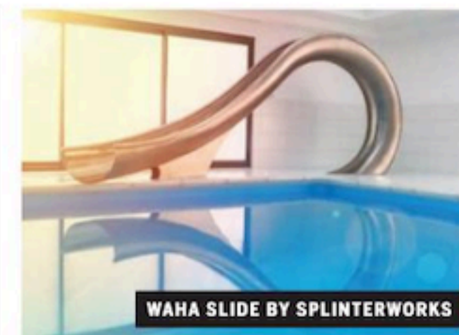
WAHA SLIDE BY SPLINTERWORKS

A water connection reduces traction giving a faster slide. Water can also effectively turn your slide into a water feature for year-round interest. However, slides are fun, with or without water. They really come into their own as a piece of garden sculpture, and are attractive to look at throughout the year.