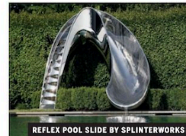
REFLEX POOL SLIDE BY SPLINTERWORKS

“DECORATIVE SLIDES DESIGNED AS ONE-OFF PIECES ARE BECOMING MORE POPULAR, CREATED TO MAKE A STATEMENT AND ATTRACT AN AUDIENCE”