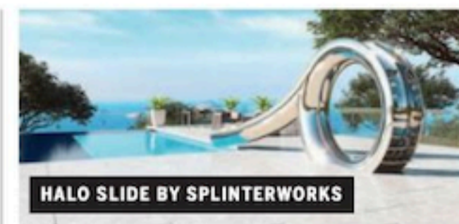
HALO SLIDE BY SPLINTERWORKS

each other down. Working with SplinterWorks, it created a fun slide that doubles as a fabulous architectural feature.