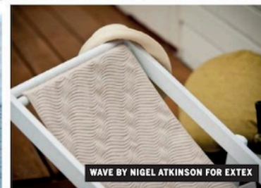
WAVE BY NIGEL ATKINSON FOR EXTEx

breathable, allowing the air to pass through them to enable quick drying. Dirt and debris can be brushed off before it gets embedded in the fabric and bleach can be used to remove tough stains – they can even be pressure washed. Sunbrella's fabrics work equally effectively for upholstery, drapery, cushions, sun umbrellas or shade sails.