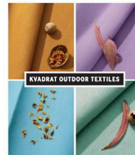
KVADRAT OUTDOOR TEXTILES

All in all, these high-performance fabrics soften and luxuriate our outdoor spaces adding warmth, texture, and interest, as they help extend the time we can comfortably spend outside.