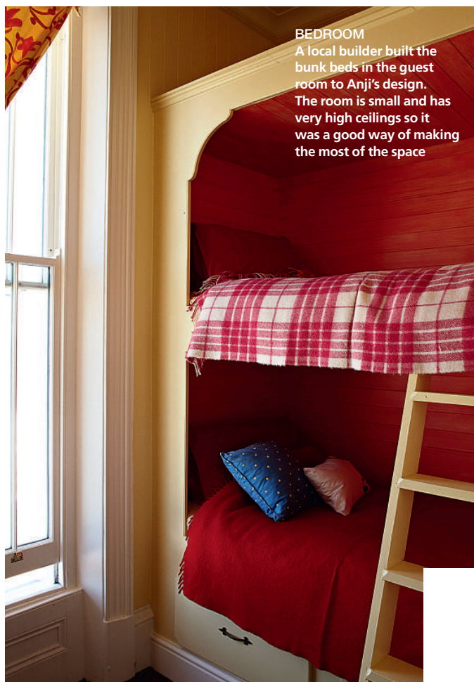
BEDROOM A local builder built the bunk beds in the guest room to Anji's design. The room is small and has very high ceilings so it was a good way of making the most of the space