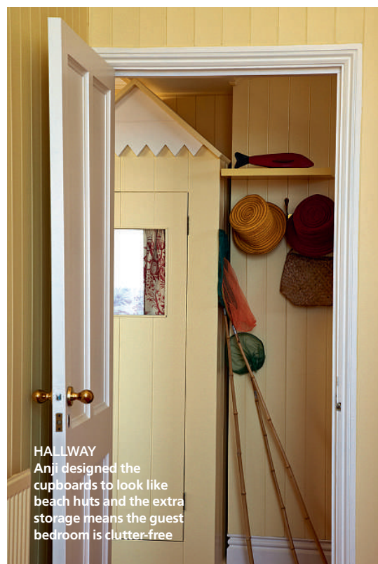
HALLWAY Anji designed the cupboards to look like beach huts and the extra storage means the guest bedroom is clutter-free