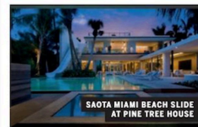
SAOTA MIAMI BEACH SLIDE AT PINE TREE HOUSE