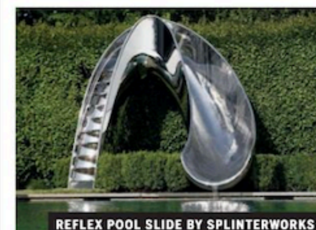
REFLEX POOL SLIDE BY SPLINTERWORKS

“DECORATIVE SLIDES DESIGNED AS ONE-OFF PIECES ARE BECOMING MORE POPULAR, CREATED TO MAKE A STATEMENT AND ATTRACT AN AUDIENCE”