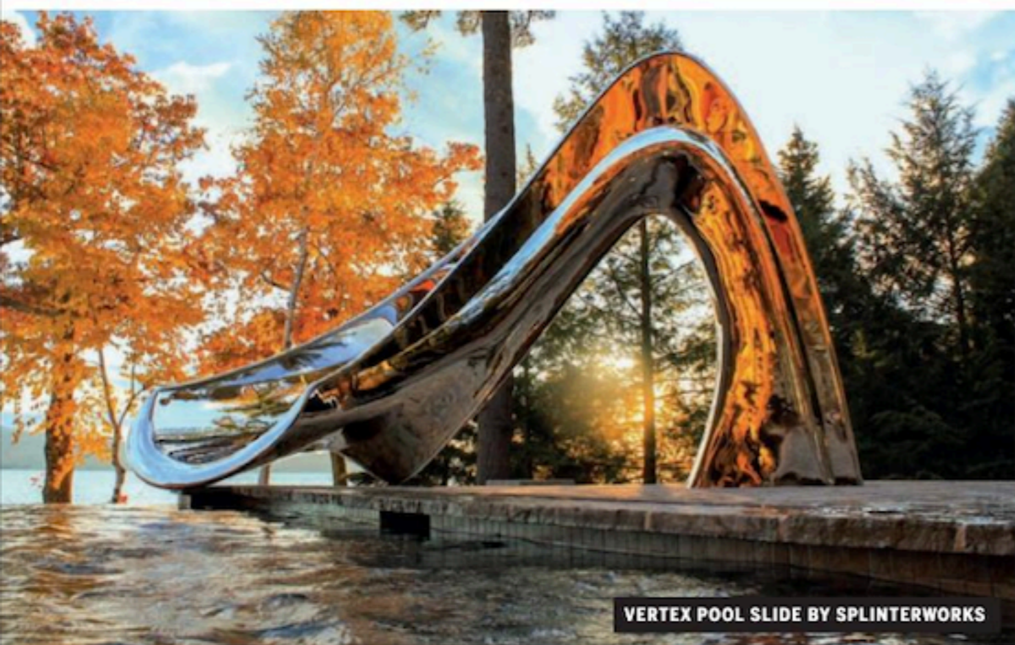
VERTEX POOL SLIDE BY SPLINTERWORKS

SplinterWorks is currently the only company making sculptural pool slides. To date, most of the work has been with residential clients, but the company now has pieces being installed into hotels.