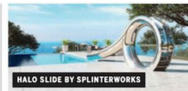
HALO SLIDE BY SPLINTERWORKS

each other down. Working with SplinterWorks, it created a fun slide that doubles as a fabulous architectural feature.