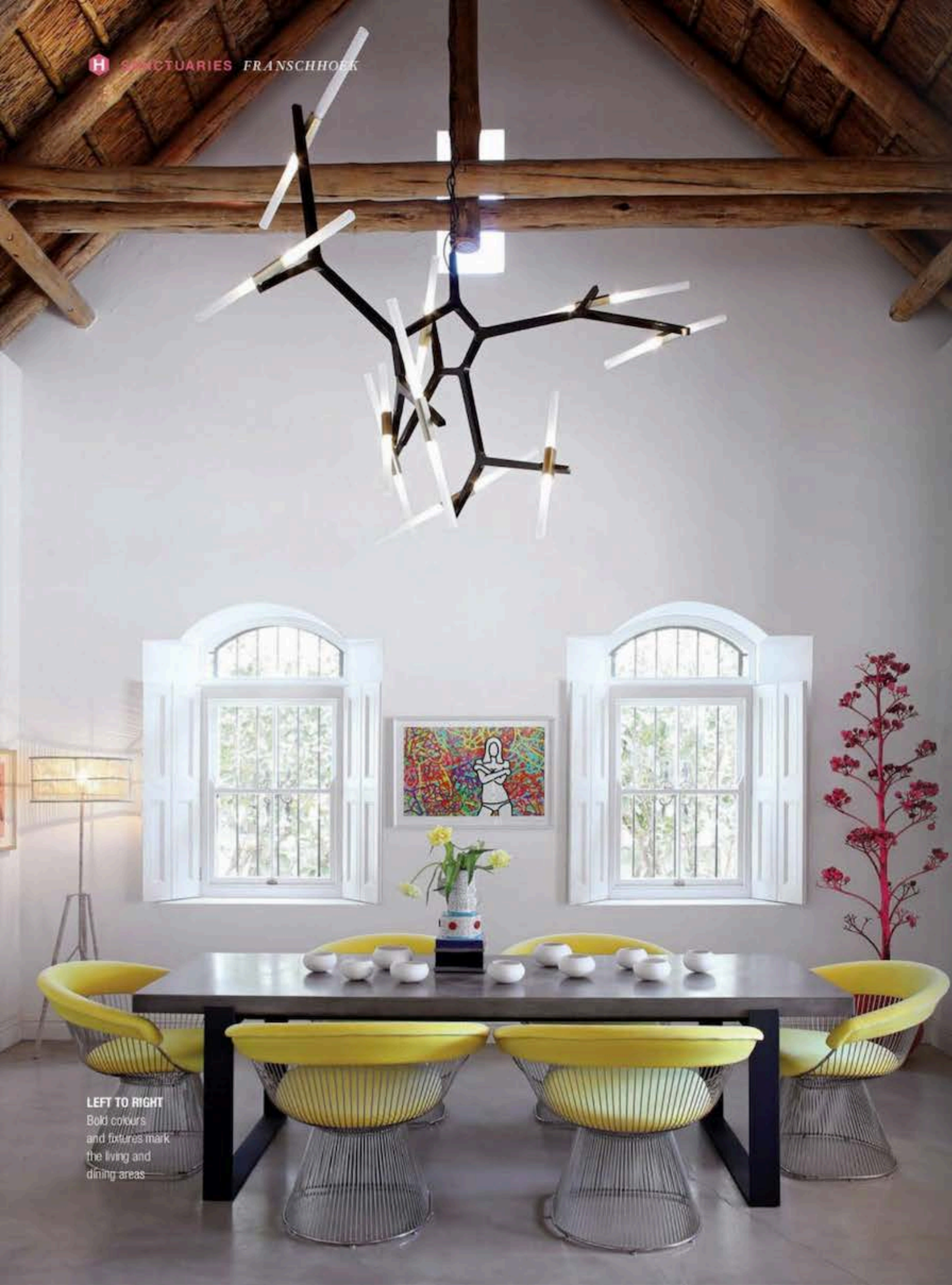
LEFT TO RIGHT Bold colours and fixtures mark the living and dining areas